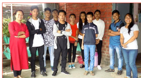
Figure 1 Children from Imphal, Manipur