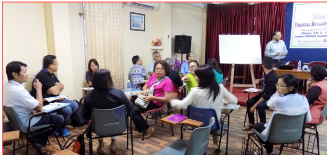
Figure 3 Finance Training