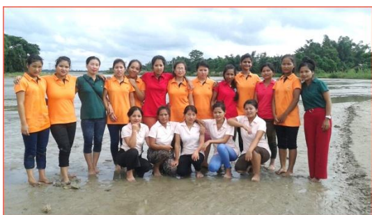
Figure 2. ALTDC, Guwahati, Assam